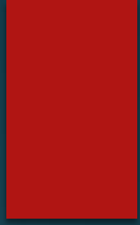
Confirmed Locations Growth All Time