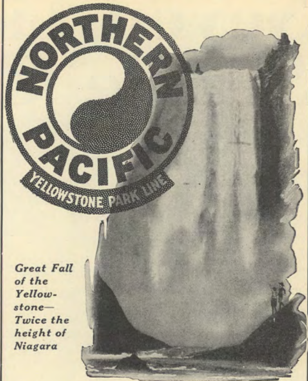
Great Fall of the Yellowstone—Twice the height of Niagara

Send for interesting book: "FACTS ABOUT THIN PAPERS"