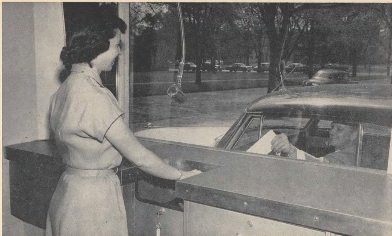
A drive-in window with a two-way speaker system has been installed on the south side of the building for the convenience of customers who desire to transact business without leaving their cars.