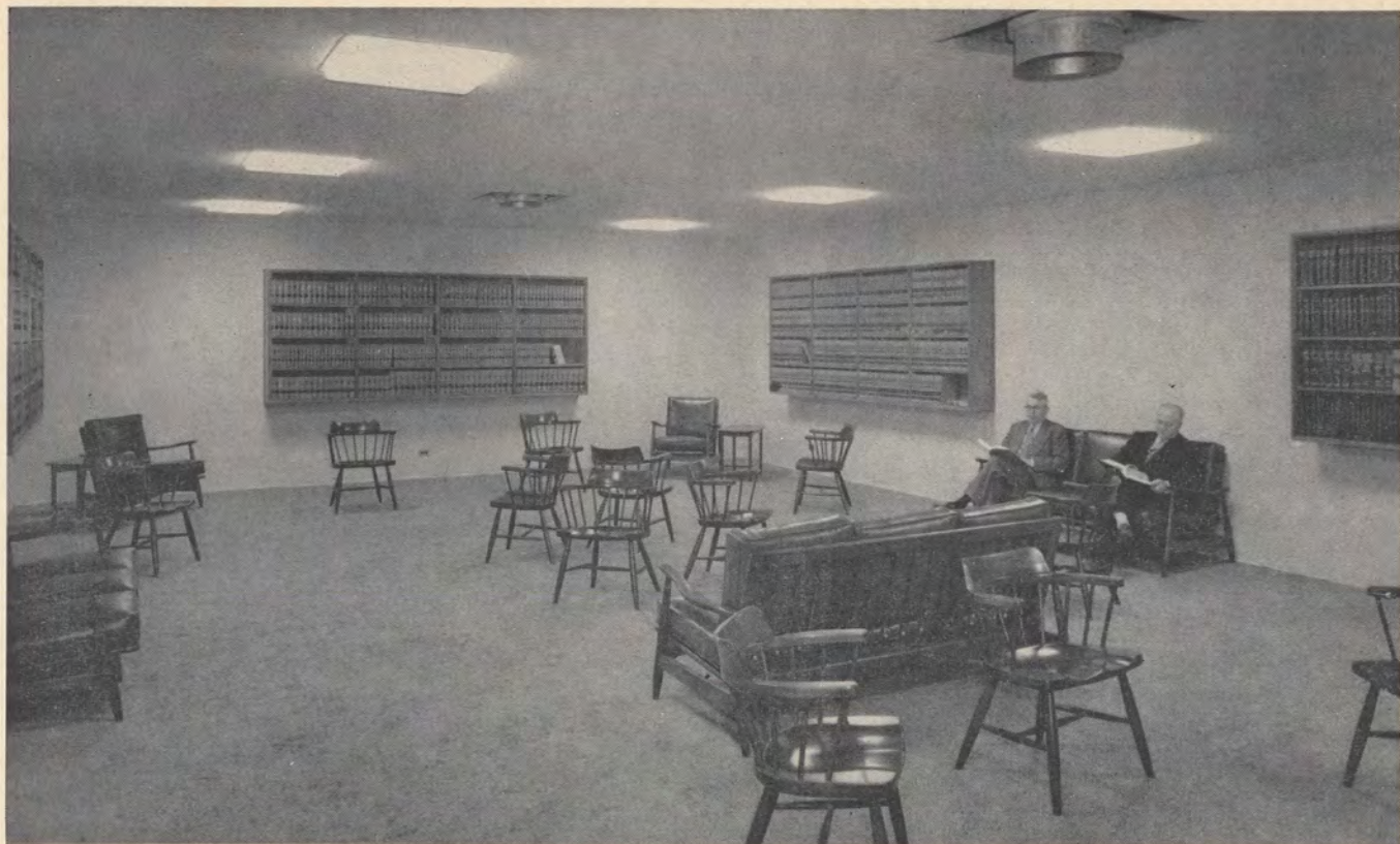
Another important feature of the new offices and title plant is the law library and reading room, not yet completed, which have been set aside for the use of the DuPage County Bar Association.