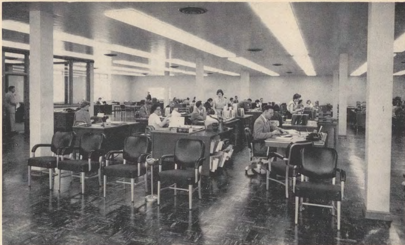
All production and customer facilities are available in one large room. Shown here is a close-up view of one of the company's examining units.