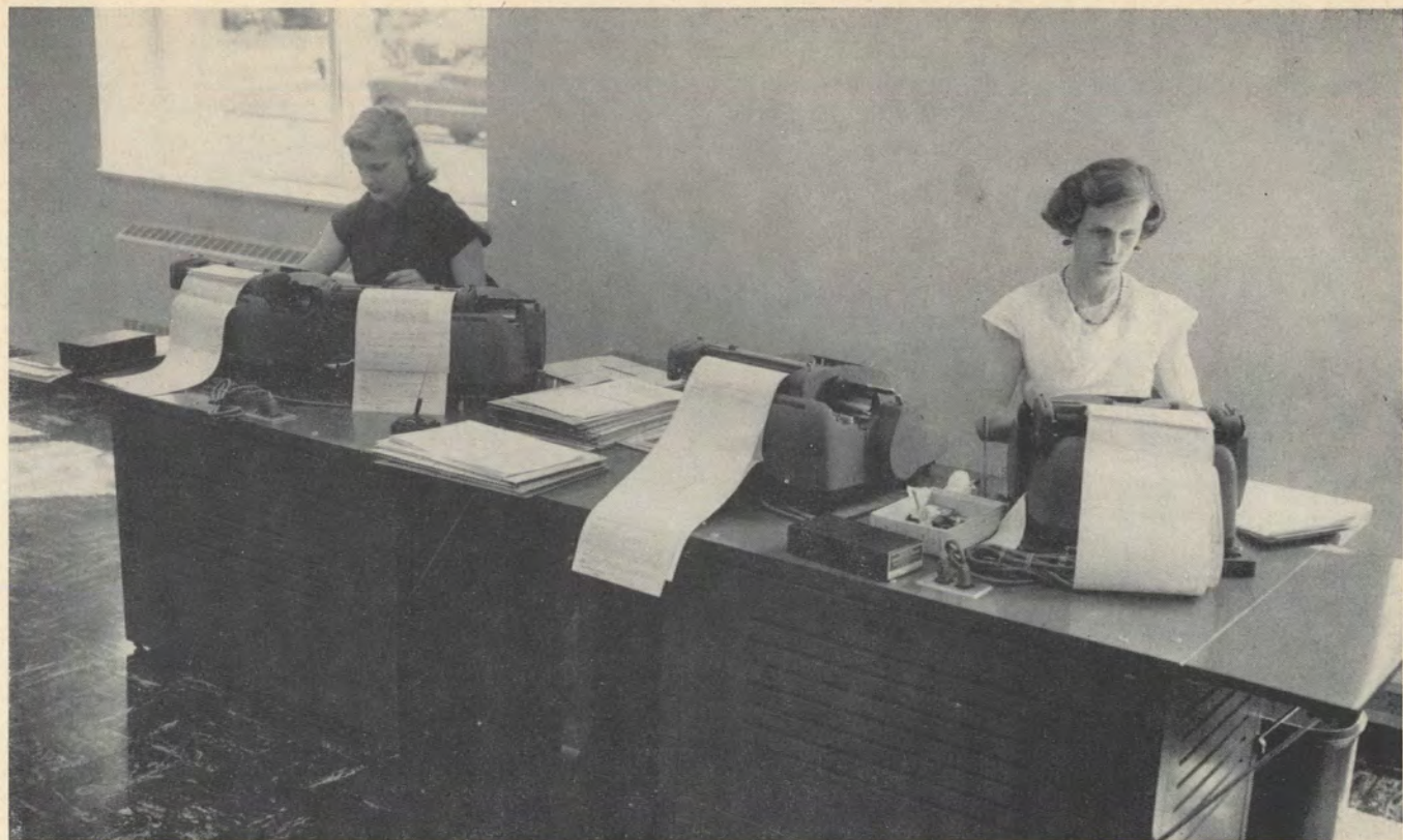
Automatic typewriting machines are part of the modern equipment, which has been installed to speed operations and step up title insurance service.