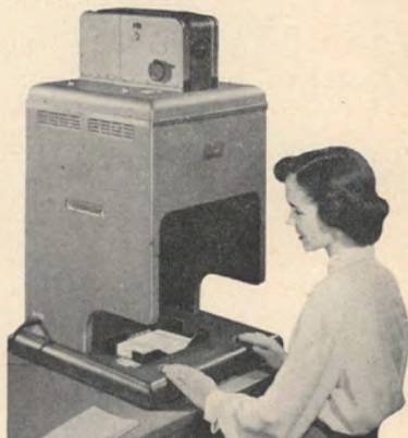
The Recordak Junior Microfilmer—one of 6 models designed for copying office records.