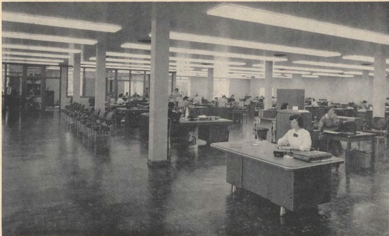
This general view shows the "open design" of the entire plant. The three private offices at the left are the only enclosed areas of the floor.