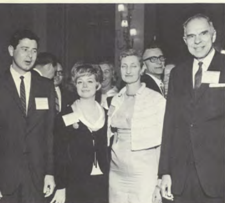
ABOVE: Glenn T. Seaborg, Chairman of the Atomic Energy Commission, and Mrs. Seaborg visit with old friends at ALTA's party.