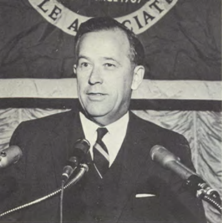
Members responded enthusiastically to the dramatic speech by U.S. Senator Henry M. Jackson.