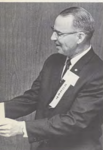
BE: ent of the Arkansas Land Title Traveler Certificate to National the banquet preceding the mas-