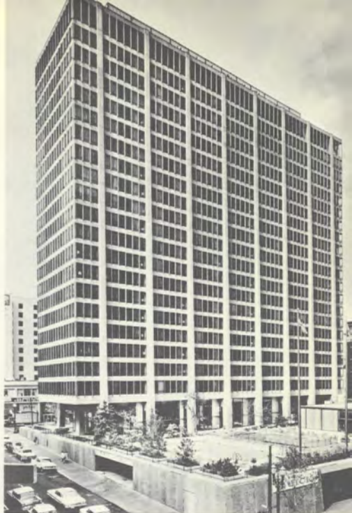
ABOVE: Tallest building in Oregon, the Portland-Hilton Hotel, is the site of ALTA's 1968 annual convention.