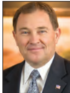
Utah Gov. Gary Herbert